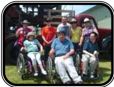
Geelong Vintage Car Rally

Thank you to St. Laurence for the use of the bus. Unfortunately, this arrangement is no longer available to us, so we intend borrowing Cass House's bus or continue walking to outings/ activities within the Colac area.