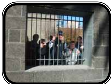
Locked up in the cells