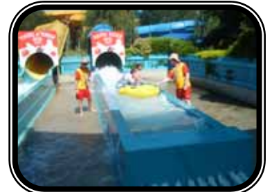
Making waves at Adventure Park