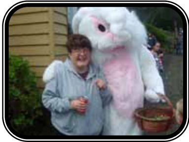
Easter at Flagstaff Hill