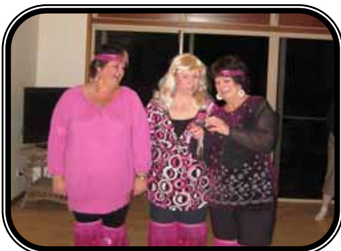
The staff had just as much fun as the clients