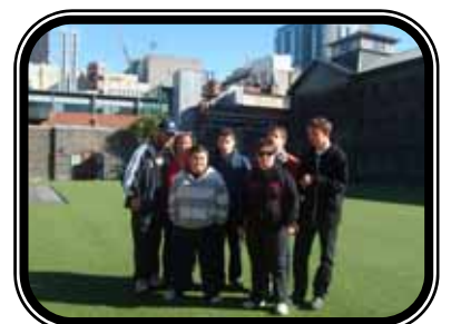
Old Melbourne Gaol