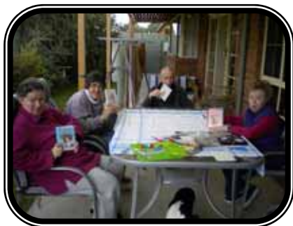
Card making in Wednesday Program

Our residents remain confident in accessing these businesses and attending their individual activities, with the help and support of those mentioned above, thank you.