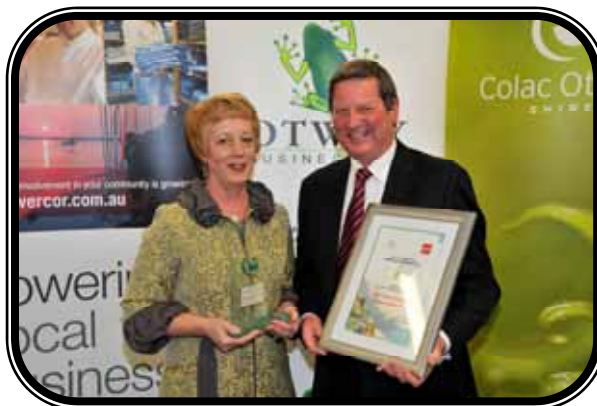
The Colac Herald 17th October, 2010

During 2010, CODA was nominated and awarded the Community Enterprise Award, again recognizing the regard in which this organisation is held. COPACC set the stage for a glittering awards presentation, and it was exciting to have some of our staff able to attend the ceremony and enjoy our success.