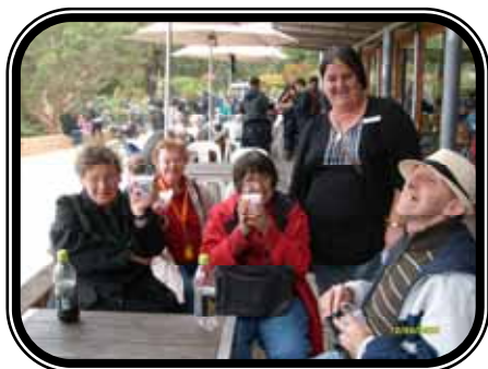
A day out to the Werribee Zoo

As the residents age, and have more health issues, a lot of staff time is spent at health appointments. Our residents need a lot more support to maintain good health and quality of life, with a lot more frequent and varied appointments. The contrast in the level of competency and energy of our residents, say in the last five years, is vast. The staff are required to do more and more to support our residents in everyday activities. It is a concern regarding the level of care increasing and the funding model of Jalmah- again, an ongoing issue.