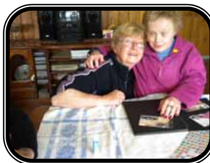
Making memory book in Wednesday Program